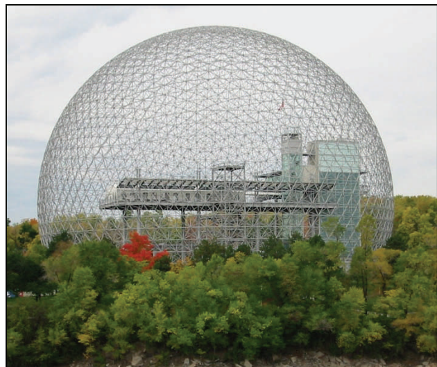
The Montreal Biosphere designed by Buckminster Fuller, 1967 offers a futuristic vision of a better world led by science and technology

Looking Backward: 2000-1887 is a utopian novel written by Edward Bellamy in 1887. In the U.S. it was the third best-selling book of the 19th century. The story is about a man who falls asleep in the year 1887 and wakes up in the year 2000. He spends most of the book talking about the wondrous changes that had occurred in the previous century. This is one of the few books that actually created a political movement. It captured the imagination of a population looking forward to the 20th century with great concern.