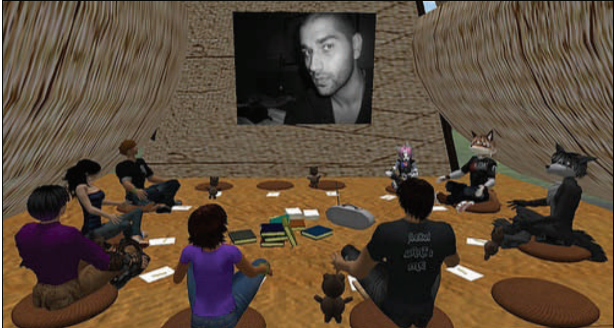
“Deconstructing Darfur” workshop held for teens in Teen Second Life virtual world