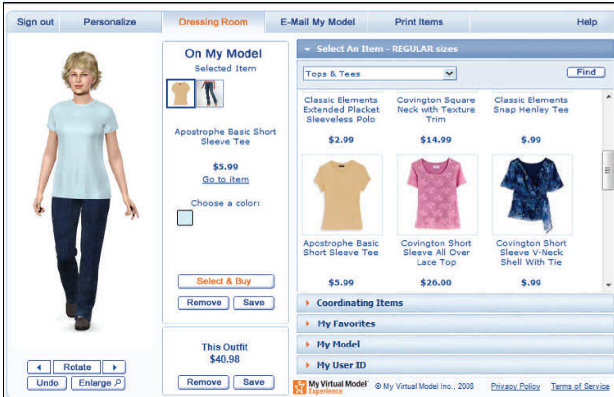
Sears My Virtual Model Experience for shopping online