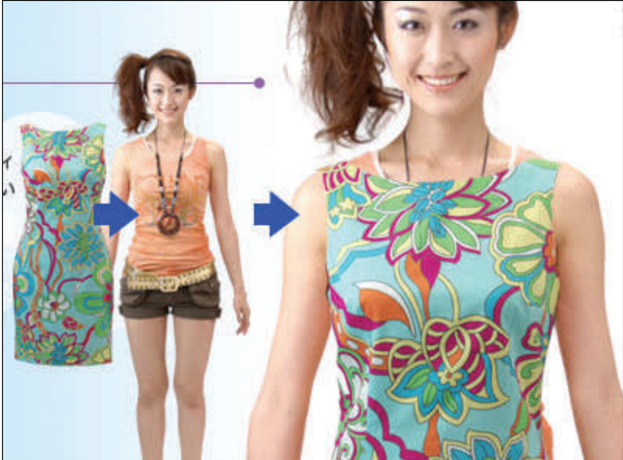
Picture of yourself uploaded on the Internet