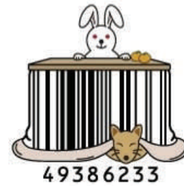
New Japanese barcodes are at least entertaining.

Retail is one of the most competitive industries. Merchants keep cutting costs wherever they can to increase profit margins. They