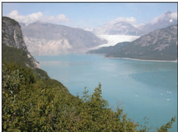
Changes are coming quickly. The picture on the left is of Muir Glacier in Alaska, taken on August 13, 1941. The picture on the right was taken on August 31, 2004. In just 63 years, the glacier has retreated more than 12 kilometers and is backfilled by ocean water.