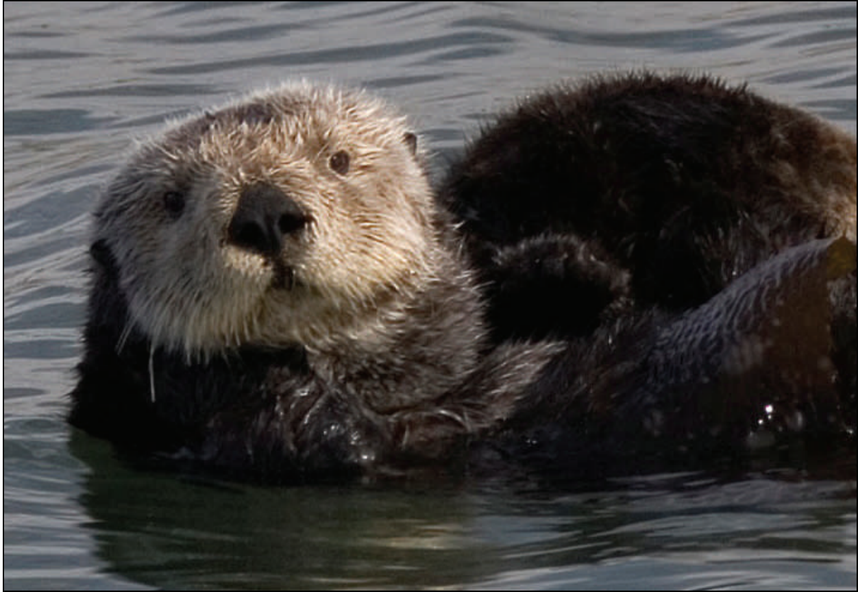
The Sea Otter is an endangered species.