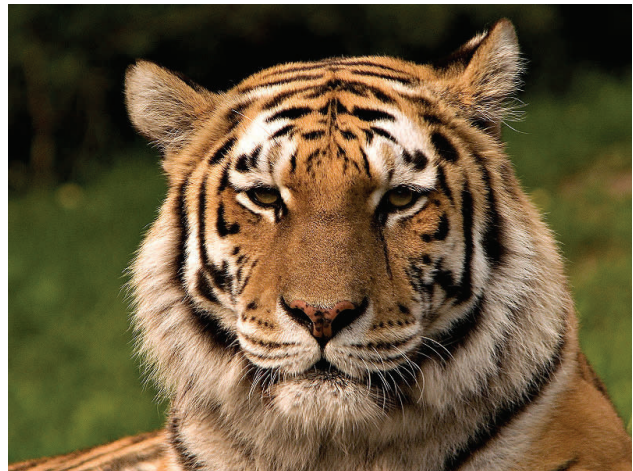
The Siberian Tiger is a large, rare, and highly endangered species. There may be fewer than 200 in the wild. Their habitat is reduced by deforestation and they are hunted for use in folk medicines.

The polar bears are among the largest and most majestic of the Earth’s threatened and endangered species. But they have lots of company.