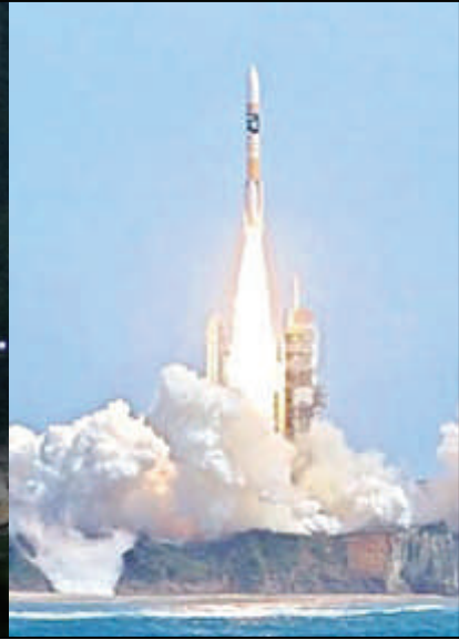
Indian Chandrayaan-1 launched India's first Moon mission, October 22, 2008