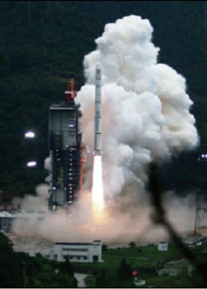
Chinese Chang'e 1 launched a Lunar satellite, October 24, 2007