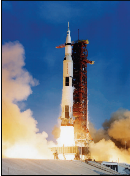
U.S. Saturn V rocket launched Apollo 11 to the Moon, July 16, 1967